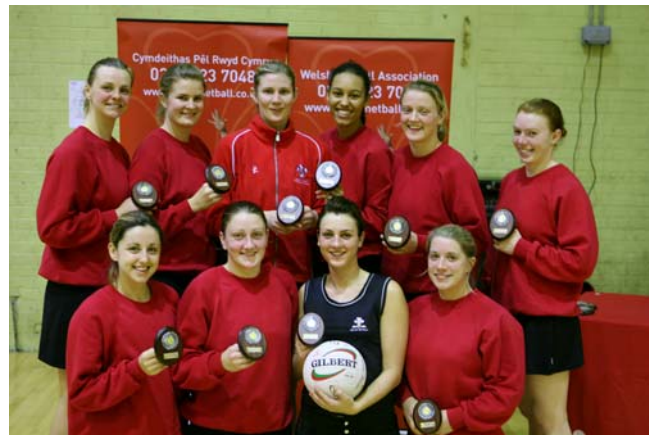
NORTH EAST WALES OPEN INTER AREA WINNERS