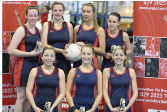
Treharris Netball Club U17 National Club Winners