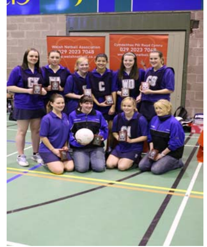
LLANTRISANT BIG WEEKEND OF NETBALL MIXED NETBALL WINNERS