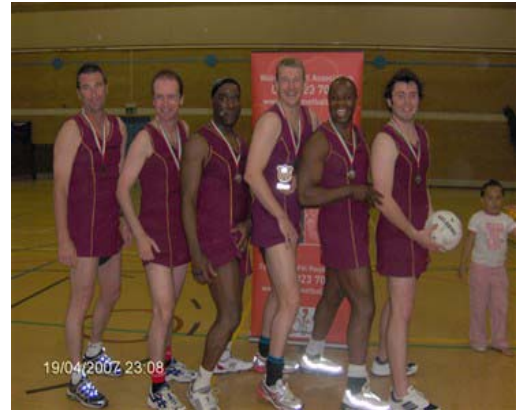
SOME OF THE PICTURES TAKEN AT 2007 NETBALL EVENTS ...