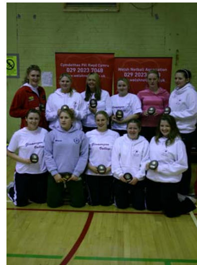
WELSH NETBALL EASTER FUN DAYS Colcot Leisure Centre, Barry